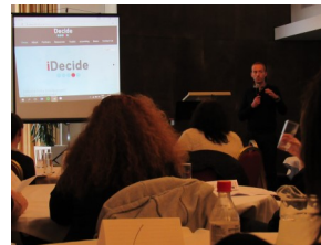
Presentation to Youthreach Leaders, Ireland

Emphasis was given to how the toolkit will benefit the school community, including principals, teachers, students and parents.