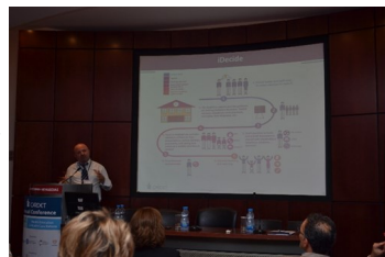
Presentation to 9th Innovative learning

The conference was organized by CARDET, INNOVADE, the Yale School of Public Health, the Cyprus Ministry of Health, the Cyprus Pedagogical Institute and the Cyprus Ministry of Education and Culture with the support of the UNESCO chair of the University of Nicosia.