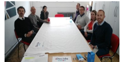
Focus Group, LMETB,

The output of these two tasks is reflected in a synthetic report produced by the WP1 leader (UOP).